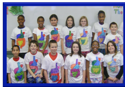
Fifth graders learn about the insides of their body and illustrate their organs on t-shirts.

21 st Century learning skills will be implemented in all grades. Inquiry skills go beyond content knowledge. Students are engaged in thinking skills that involve them in learning beyond a textbook – hands on activities, group projects and computer-based learning. At St. Bernadette School, learning is engaging and fun!