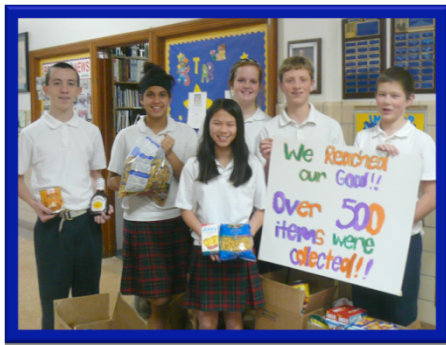
Student council members surpassed their goal of collecting 500 cans for the needy. Service is important to our school community.

Everything we do and learn revolves around Jesus. Students participate in daily prayer, weekly Mass, and numerous prayer services. Service projects that assist those in need are conducted throughout the year.