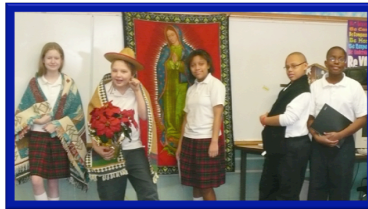
Sixth graders present a short skit to celebrate the feast of Our Lady of Guadalupe.